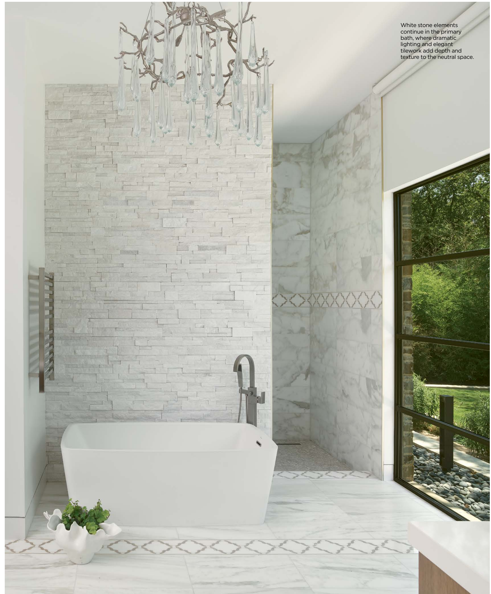
White stone elements continue in the primary bath, where dramatic lighting and elegant tilework add depth and texture to the neutral space.