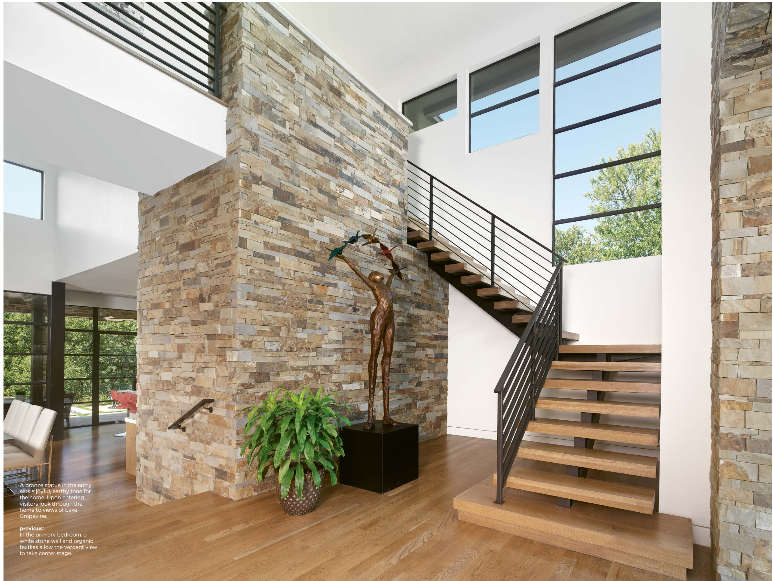
A bronze statue in the entry sets a joyful, earthy tone for the home. Upon entering, visitors look through the home to views of Lake Grapevine.